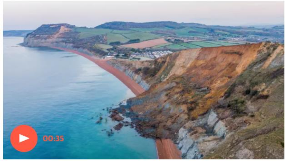
▲ Huge Dorset Jurassic Coast rockfall revealed in drone footage – video

People urged to stay away from Dorset beach with council expecting more unstable cliff face to fall