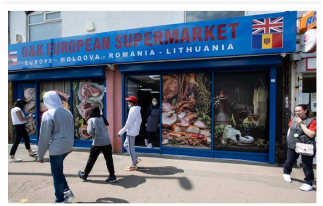
Some 5.61 million people have applied for settlement status in the UK, two million more than predicted