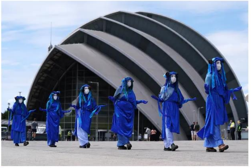
An Extinction Rebellion protest in Glasgow this month.

Financial aid 'critical' to help developing countries limit fossil fuels - and make Cop26 a success, says UN