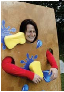
Sponge a teacher