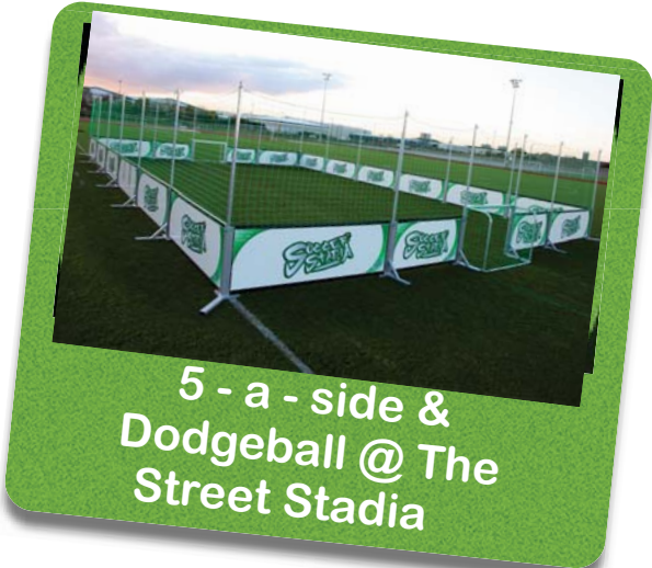
5 - a - side & Dodgeball @ The Street Stadia

Jewellery Sale Treat yourself or buy a gift and help raise money for Newlife.